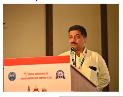
Post Operative Biliary Leak after Lap. Chole.