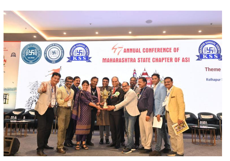
8<sup>th</sup> Feb.: Day 3. 1<sup>st</sup> Day of the Conference:

5 parallel Halls, Hall A to E! Some highlights: